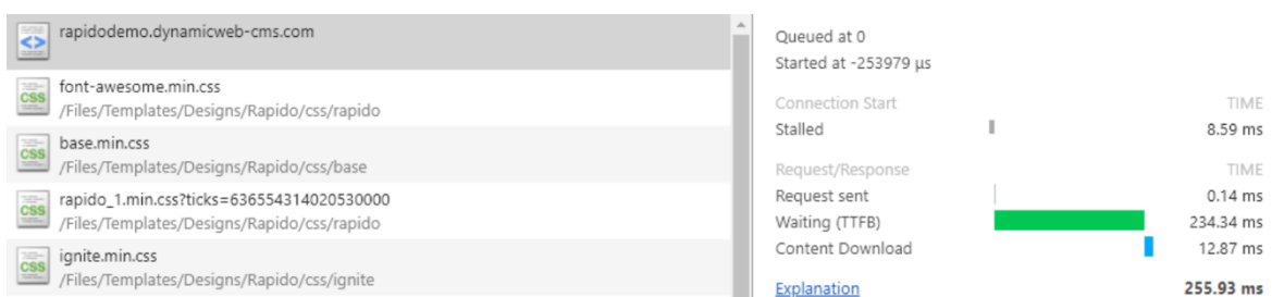
Figure 1: “Waiting (TTFB)” in Chrome developer tools is the measurement metric.

The time spend here is the time the server uses to execute Dynamicweb and generate the page that the user wants to download. This time varies very little no matter how slow the user’s internet connection is. This is the performance of the solution and the server.